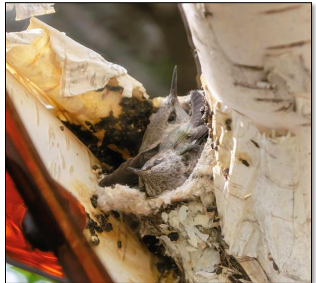
2 nd Three or Four Day Old Baby Hummingbirds In Their Nest Maurice Krumrey