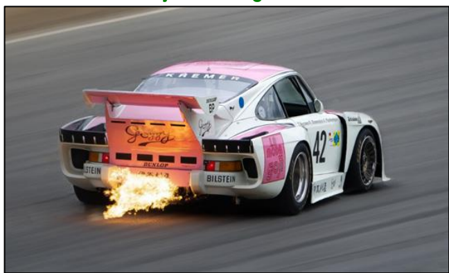
HM Race car with flaming exhaust as hot unburnt excess fuel leaves tailpipe during hard deceleration Jason Cheng