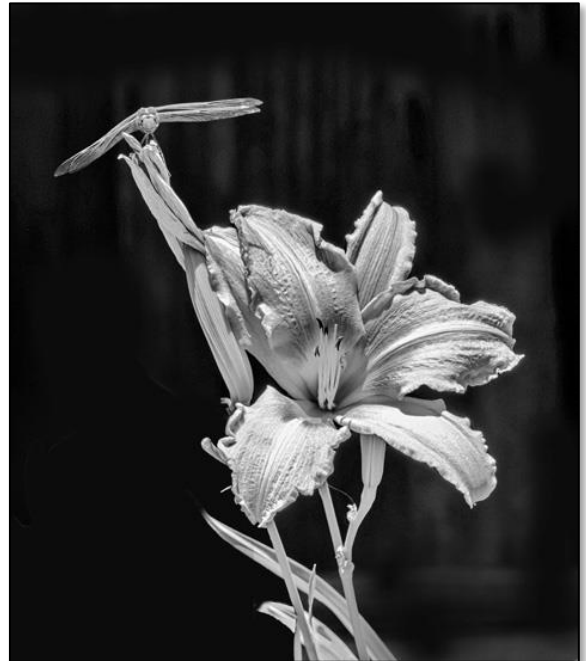
3 rd Dragonfly On Day Lily HM A Tree on the Rock