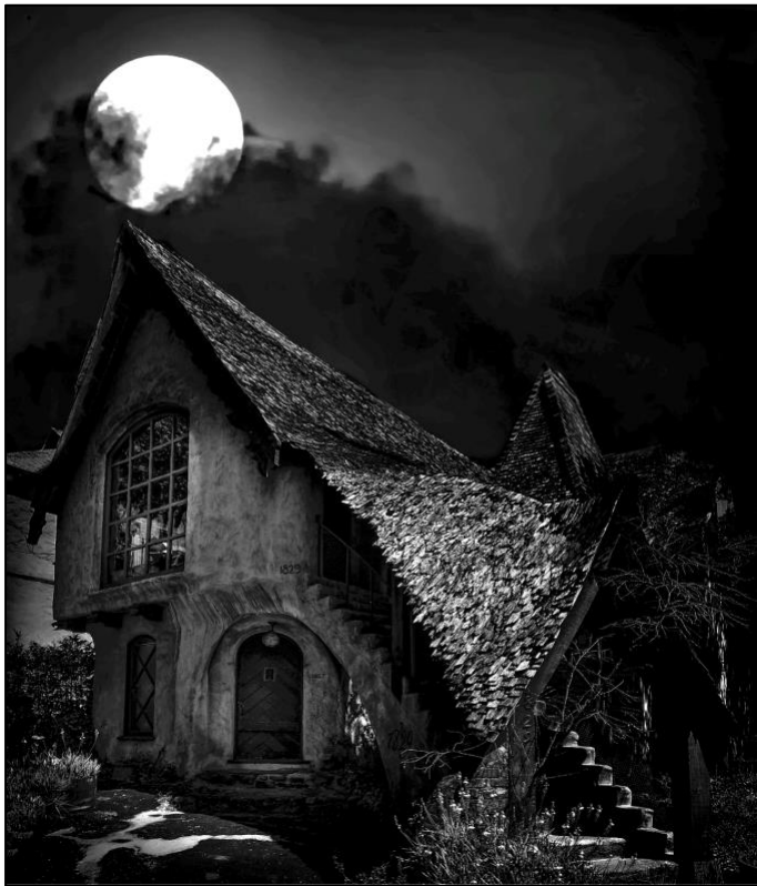
1 st Moonlight Over Normandy