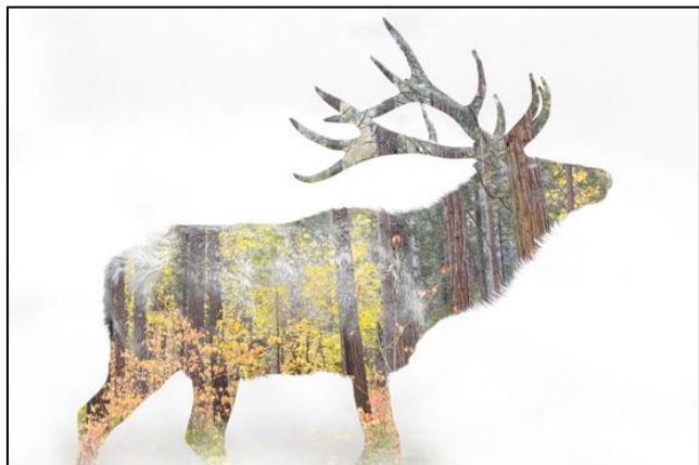
3 rd You are what you eat! Sree Alavattam HM Film records an attempt to use a folding bed view camera Doug Stinson