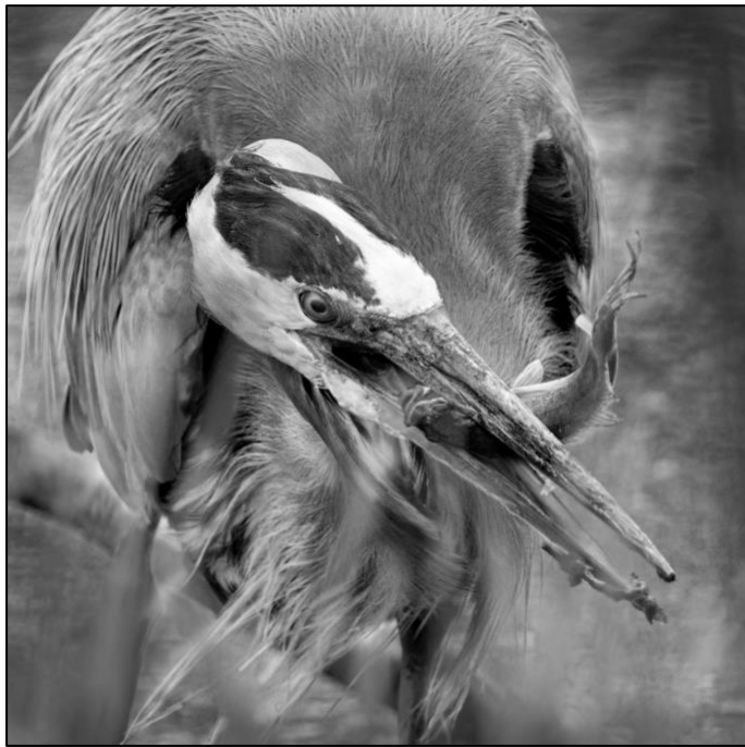
2nd Great Blue Heron with Fish and Debris. Ed Levin County Park. Milpitas, CA