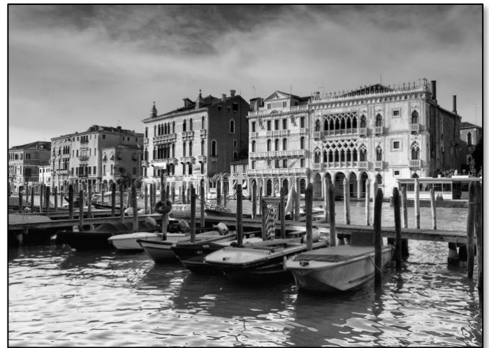
3 rd Early Morning in Venice