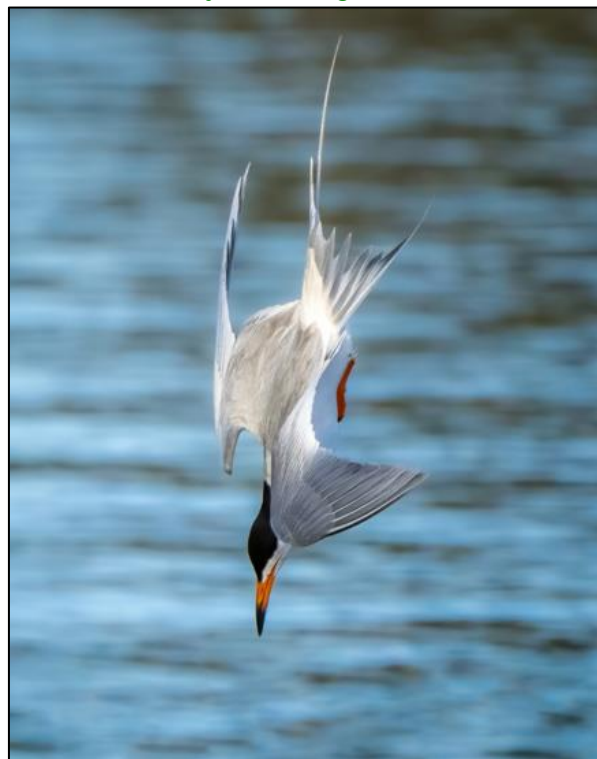
3rd Forster Tern Feeding [2 of 3] They then tuck their wings and go into a fast vertical dive plunging up to 2 feet into the water. Jason Cheng