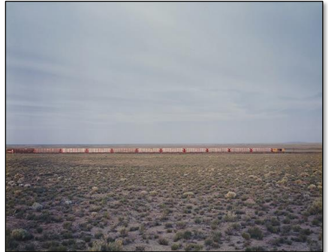
The Santa Fe (1982)