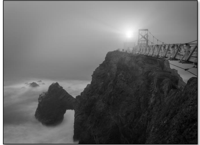
3 rd Foggy Evening At Point Bonita Arthur Widener