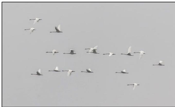
3 rd Sandhill Crane flock journeys south to winter at the Isenberg Sandhill Crane Reserve in Lodi, CA; December 2022 Greg Geren