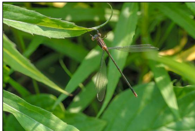
2 nd Spreadwing Damselfly (Zygoptera) Kevin Wheeler