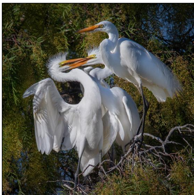
1 st Great Egret siblings tussle in the nest as an adult ignores them. Lakeshore Park, Newark, CA Greg Geren