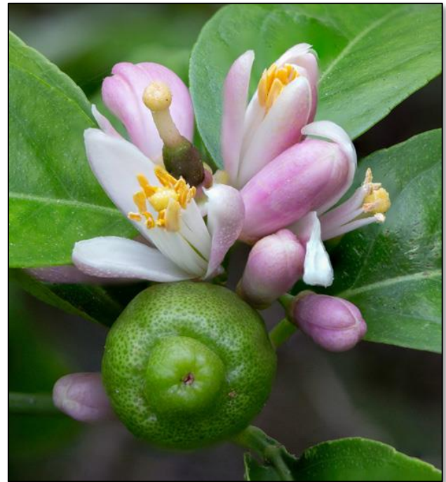
1 st Lemon flowers and incipient fruit Greg Geren