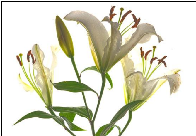
1 st Light through Blossoms (Best in Show) Greg Geren