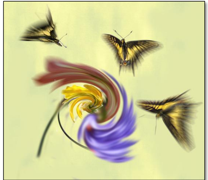
2 nd Butterfly Somersaults Over A Flower Maurice Krumrey