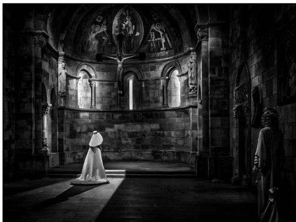
2 nd Meditation in the Fuentiduena Chapel (20380542) Paul Kessinger