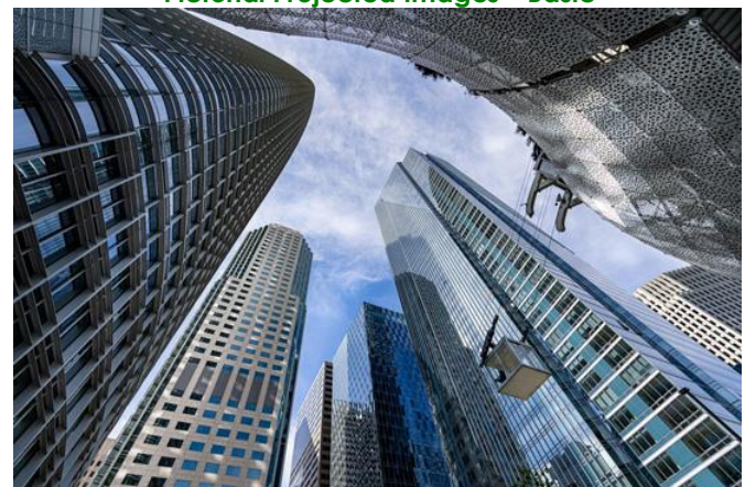
1 st The Salesforce Elevator Amidst Concrete and Glass. San Francisco, CA. 2023