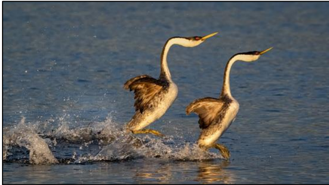
1 st Western grebes, Aechmophorus occidentalis , at up to 20 steps per second, forcefully slaps on the water's surface to patter across the water. Clear Lake, CA. 2023 May Chen