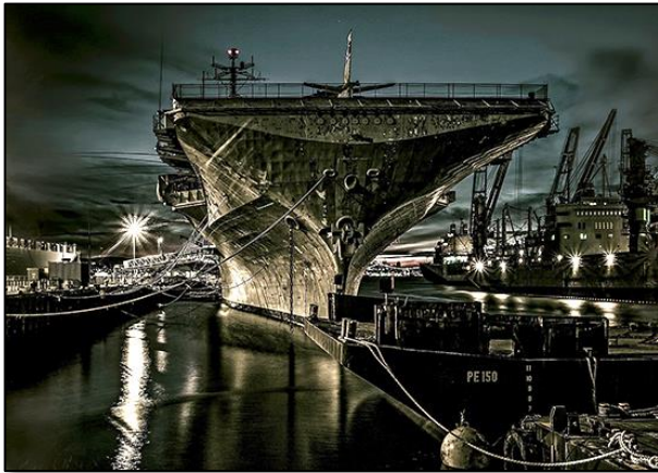
The USS Hornet at Blue Hour

the Annual Competition that meet the "Challenge" criteria.