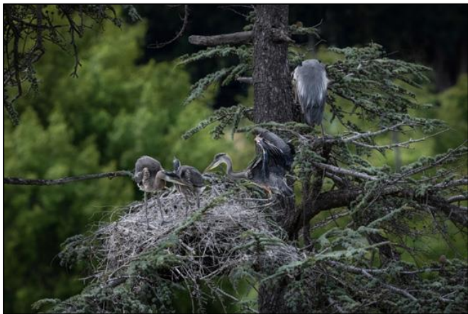
2 nd A Watchful Great Blue Heron Parent with Its Three Nearing-Fledging Young. Fremont, CA. Spring 2023 May Chen