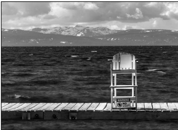
1 st No Lifeguard on Duty