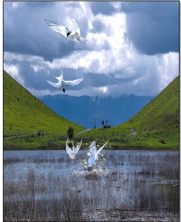
1 st Tern Diving Sequence Paul Kessinger