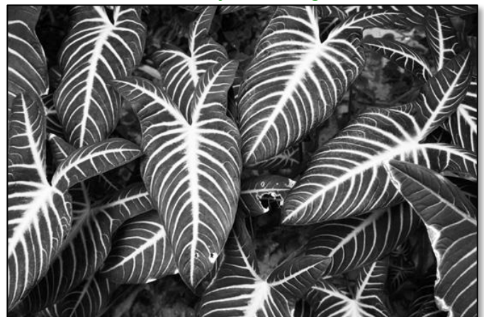
1 st Indian-Kale Stripes