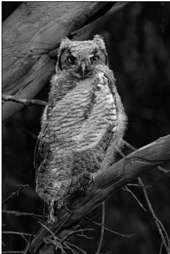
3 rd Young Great Horned Owl at Twilight. Fremont, CA 2023 May Chen