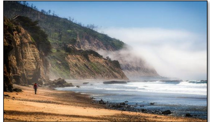
2 nd Walk on the Beach Sean Duan